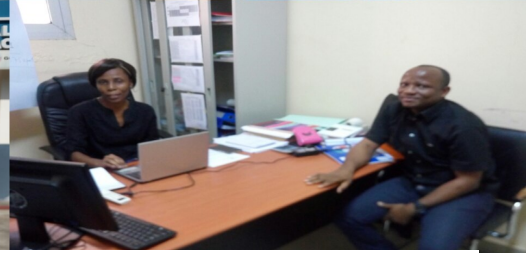
ASSESSMENT VISIT, KINSHASA , DRC (27 FEBRUARY – 2 MARCH, 2018)