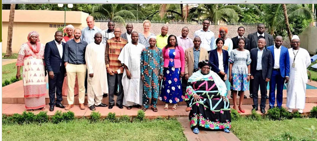
DIAMA CONSORTIUM MEETING (BAMAKO, 12-14 June 2019)